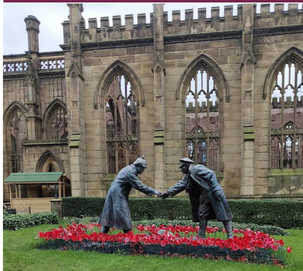
The Truce Sculpture at St. Luke's Church, Bold Street, Liverpool