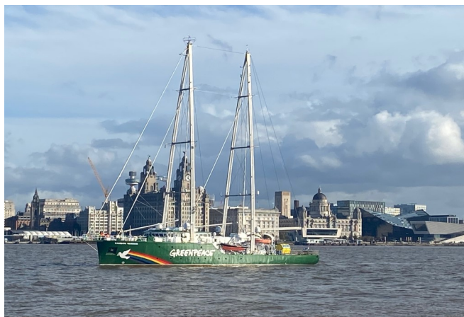
The Rainbow Warrior on the Mersey on its way to