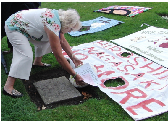
Hiroshima and Nagasaki Day