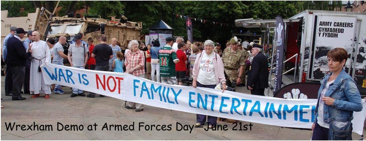
Wrexham Demo at Armed Forces Day - June 21st